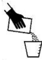
Handling dry concentrate