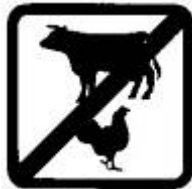
Dangerous/harmful to animals