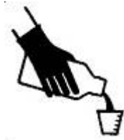
Handling liquid concentrate