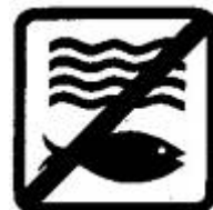
Dangerous/harmful to fish - do not contaminate lakes, rivers, ponds or streams