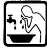
Wash after use