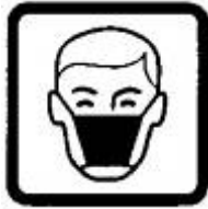
Wear protection over nose and mouth